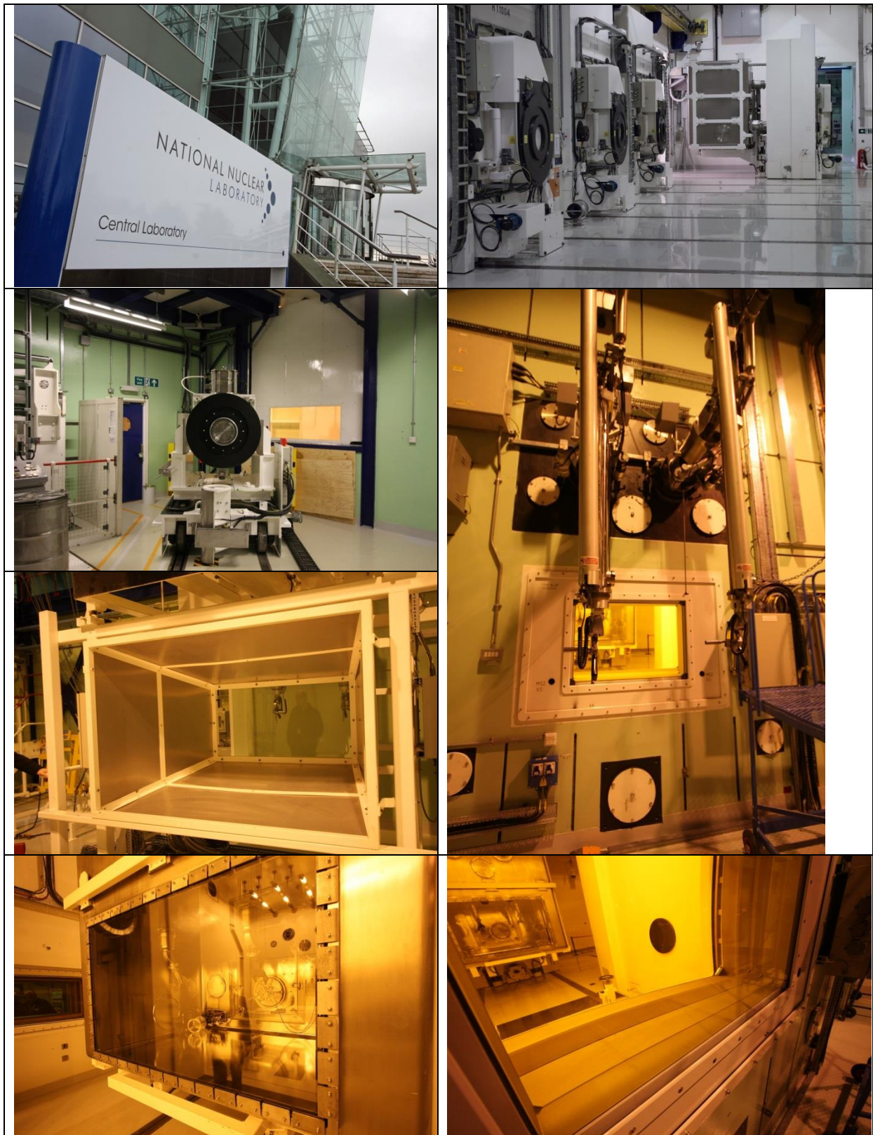
Photographs included in poster: Clockwise from top left, (1) Outside Central Laboratory, (2) Inside cell handling and transfer area, (3) Typical cell face, (4) Experimental cell withdrawn from cell face, (5) Experimental cell in transit, (6) MSMs mounted on cell window mock-up for practice/training purposes, (7) Flask operations area.