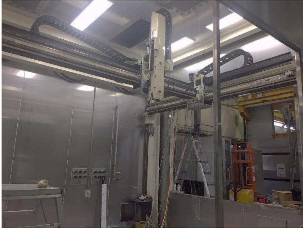
Figure 8. Precise gantry system driving by linear motor.

To minimize the dry volume, two stage telescopic mechanism was installed for z-directional motion. The workspace of the gantry system is shared by the crane system. While the crane is located parking position, the gantry system moves the rail for automation work. On the other hand, the gantry system should be located on the opposite corner to use the crane. Each system is interlocked not to be activated on the same time. A linear motor drive the gantry system, and magnetic scale was utilized for precise position feed-back.