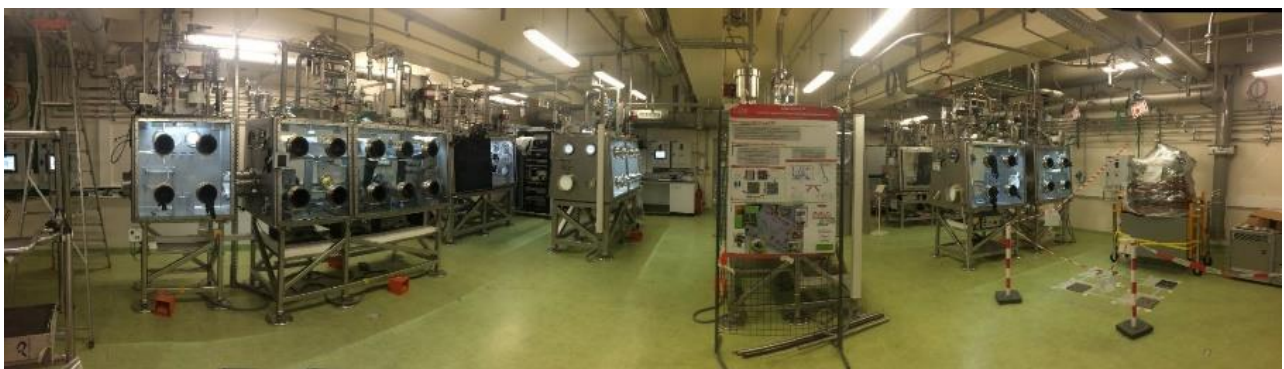
Figure 63: Characterization Laboratory