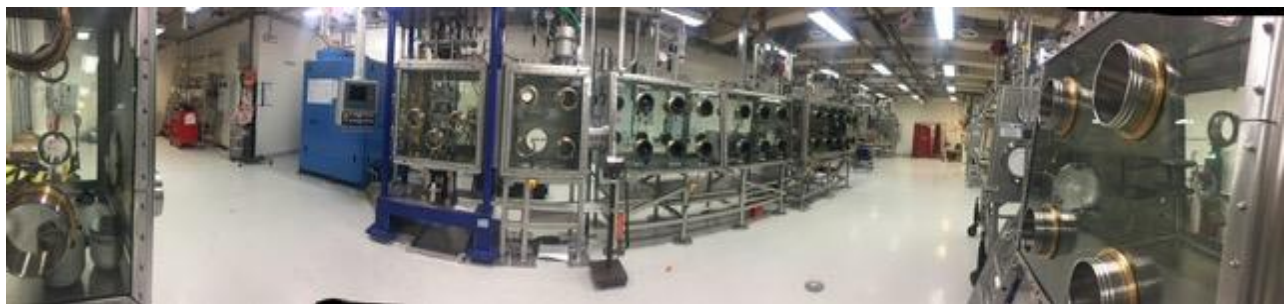
Figure 62. Fabrication laboratory