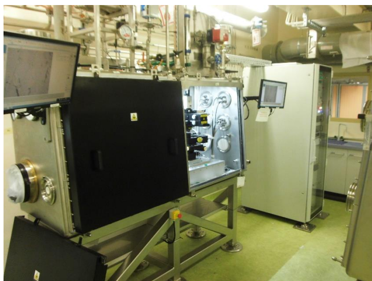
Figure P34: View of the new glovebox dedicated to Raman microscope installed in the L26 laboratory (ATALANTE Facility, CEA Marcoule, France).