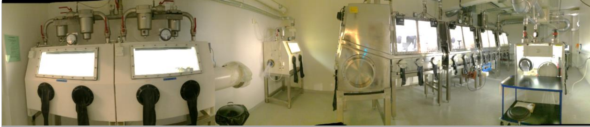
Fig 1. New alpha-lab at Kjeller Norway for MOX pellet produksjon

system is connected to emergency and UPS back up electricity supply with alarms. The fire protection system in the laboratory is an automatic water vapour sprinkler system and the glove-boxes are equipped with a manually operated halotron fire extinguisher. Further, the lab has a radiation / airborne contamination monitoring system with alarms. The lab is a separate criticality zone.