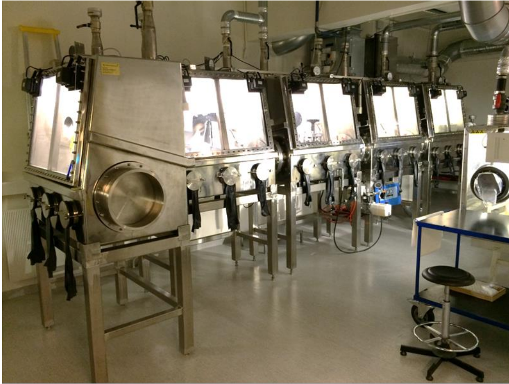
Fig.2. New line of five interconnected, separate glove boxes for Th-MOX pellet manufacture from powders equipped for powder storage, powder mixing & milling & sifting, pressing, quality control sintering.