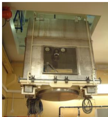
Transfer of alpha caisson for decontamination