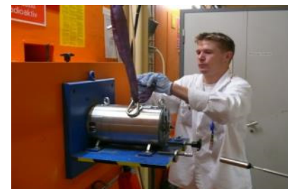
Transfer with Draht und Schrader 50