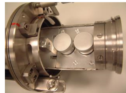
Sample container for EPMA, based on La Calhène