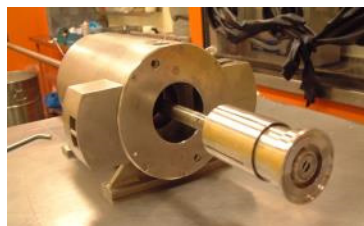
Draht und Schrader 50 system

European Commission, Joint Research Centre, Directorate for Nuclear Safety and Security, Postfach 2340, D-76125 Karlsruhe, Germany