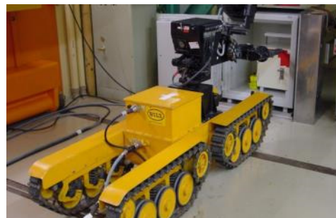
KHG remote rover with high dose sample