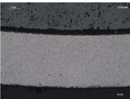
Figure 3. Cladding aspect of the fuel