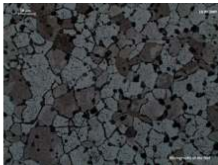
Figure 2. Fuel grains aspect in the middle of the pellet