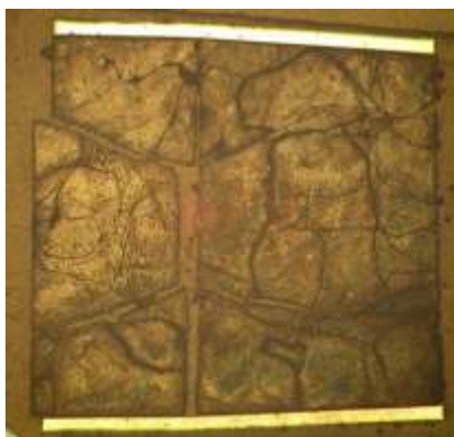
Figure 5. Macrograph of longitudinal cross-section