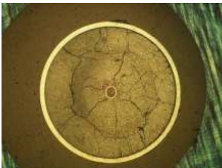
Figure 1. Experimental fuel instrumented with thermocouple

The metallographic samples were embedded in epoxy resin inside the examination cell then transferred to the metallography cell for further preparation. This preparation consists of successive polishing operations in order to achieve a plane surface of the probe, followed by chemical etching in order to highlight the microstructural characteristics of the fuel such as pellet fissures aspect, the grain growth and distribution, the porosity generated by the fission gases, oxide layer and cladding thickness, the hydride plaques characteristics and orientation. The results can be observed in the following pictures