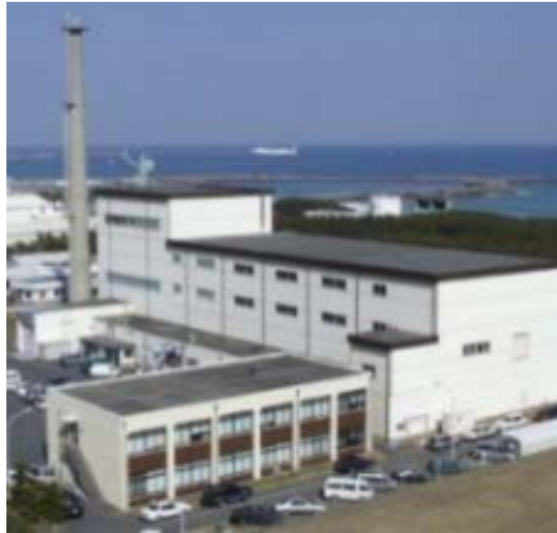
Overview of Reactor Fuel Examination Facility(RFEF)