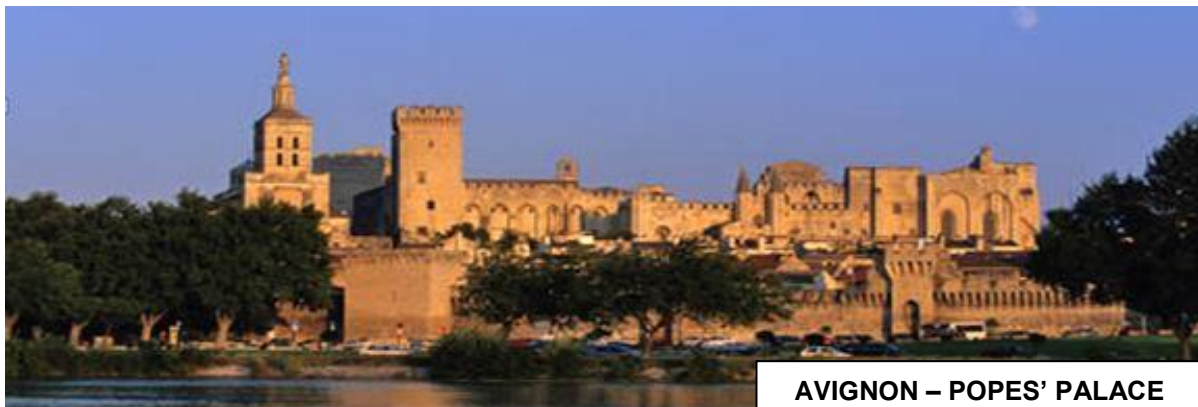
AVIGNON – POPES' PALACE